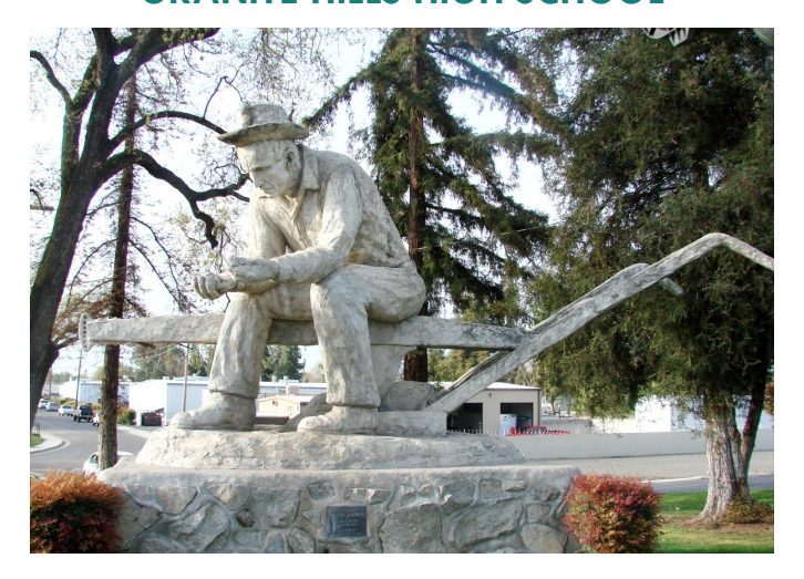
Serving the City of Porterville and Our Surrounding Communities

5:00 P.M. TO 8:30 P.M. THURSDAY, MAY 3, 2012 GRANITE HILLS HIGH SCHOOL